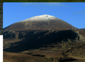
Slieve Donard 850m