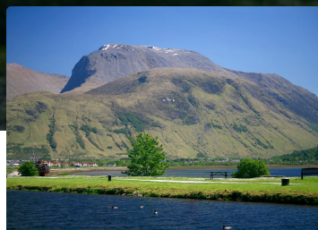
Ben Nevis 1,344m